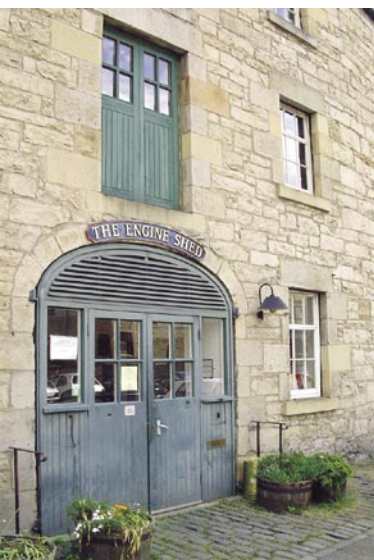
The Engine Shed at St. Leonard's now houses a bakery and cafe